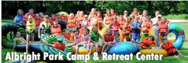
Albright Park Camp & Retreat Center

MICHIGAN AREA United Methodist CAMPING www.umcamping.org registrar@umcamping.org