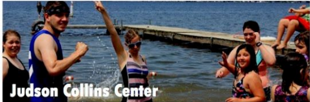
Judson Collins Center

1000 Hane Hwy., Onsted, MI 49265, 517-467-7711 info@judsoncollinscenter.org