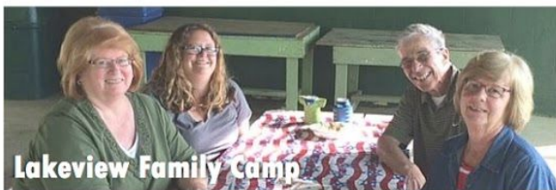
Lakeview Family Camp

5300 W. Cutler Rd., Lakeview, MI 48850, 989-352-6896 campgroundregistrations@umcamping.org