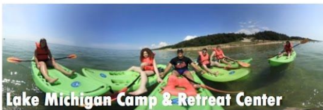
Lake Michigan Camp & Retreat Center