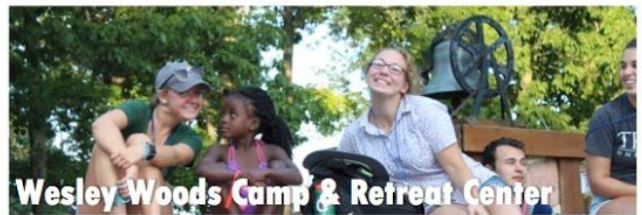
Wesley Woods Camp & Retreat Center

1700 Clear Lake, Dowling, MI 49050, 269-721-8291 wesleywoodscampdirector@umcamping.org