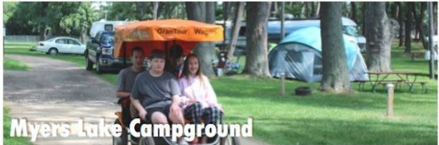
Myers Lake Campground

10575 Silver Lake Rd., Byron, MI 48418, 810-266-4511 info@myerslake.org