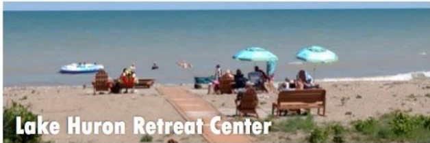
Lake Huron Retreat Center

8794 Lakeshore Rd., Burtchville, MI 48059, 810-327-6272 lakehuronretreatdirector@umcamping.org