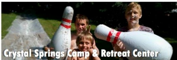
Crystal Springs Camp & Retreat Center

33774 Crystal Springs St., Dowagiac, MI 49047, 269-683-8918 crystalspringscampdirector@umcamping.org